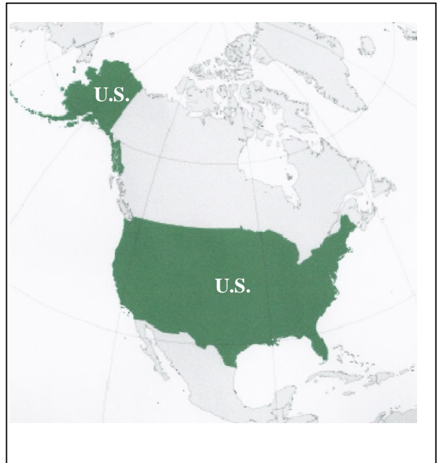
Figure 2. China Military Presence in East Pacific and West Atlantic.