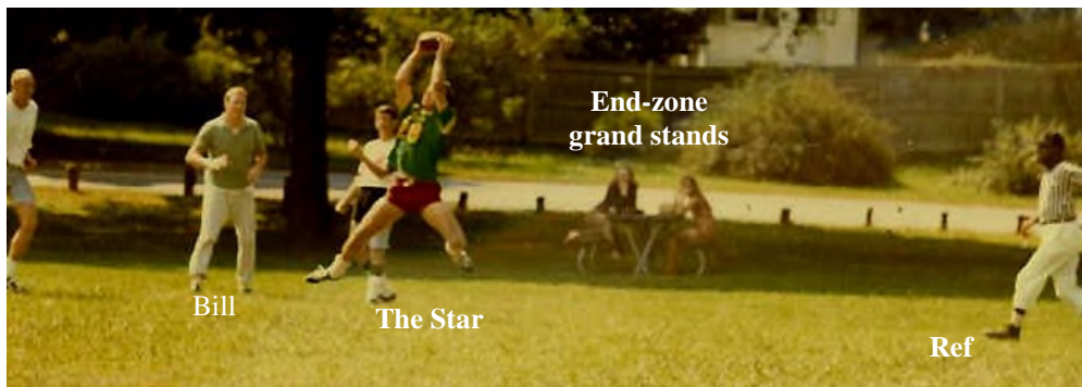
Figure 3. The most sensational play.

Present tense and back to the glorious past: No one is around me! Here comes the ball. Damn. It's high. Then jump. That's what you do anyway. Easy catch. TD! We win, a moment of glory captured by an AP photographer on the sideline (Figure 3.).