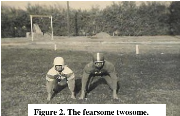
Figure 2. The fearsome twosome.

Let me begin by explaining my early football days were not easy. I was very small for my