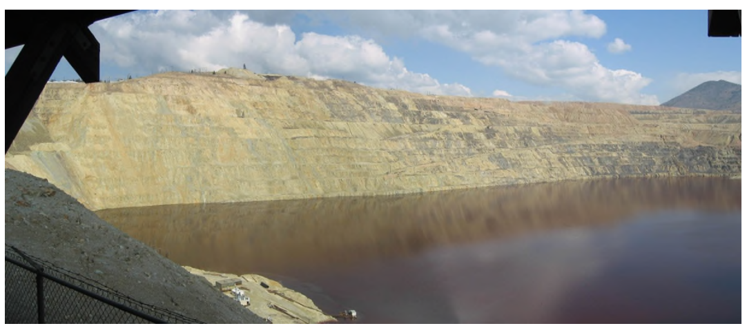
Figure 3. The Berkeley Pit.

I have visited the superfund site called the Berkeley Pit, located just outside of Butte, Montana. It is a huge hole 900 feet deep and a mile across, parts of which are shown in Figure 3.