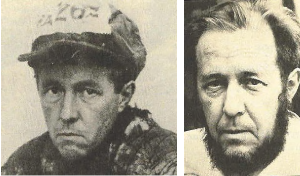
Figure 1. Aleksandr Solzhenitsyn

Solzhenitsyn's later writings resonate about the dangers of despotism, but they also point to present and future dangers for western democracies. When I first read about his criticisms of the West (especially America), I was taken-aback and was in disagreement with his views. Now, I find myself agreeing with more of his points than in the past. But I also find some of his criticisms of America and the West disingenuous.