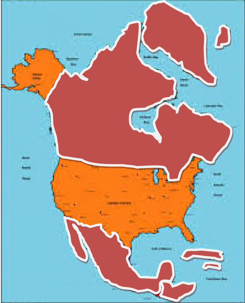
Figure 2. North America (Theoretical WATO countries in red).