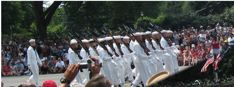
Figure 1. Leading the parade.

The first part of the parade was my favorite. The parade was led by small bands representing each of the services. Figure 1 shows two of these bands. Past duty persuaded me to highlight the U.S. Navy lads.