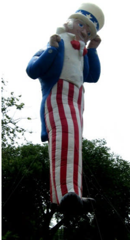
ure. Uncle Sam.