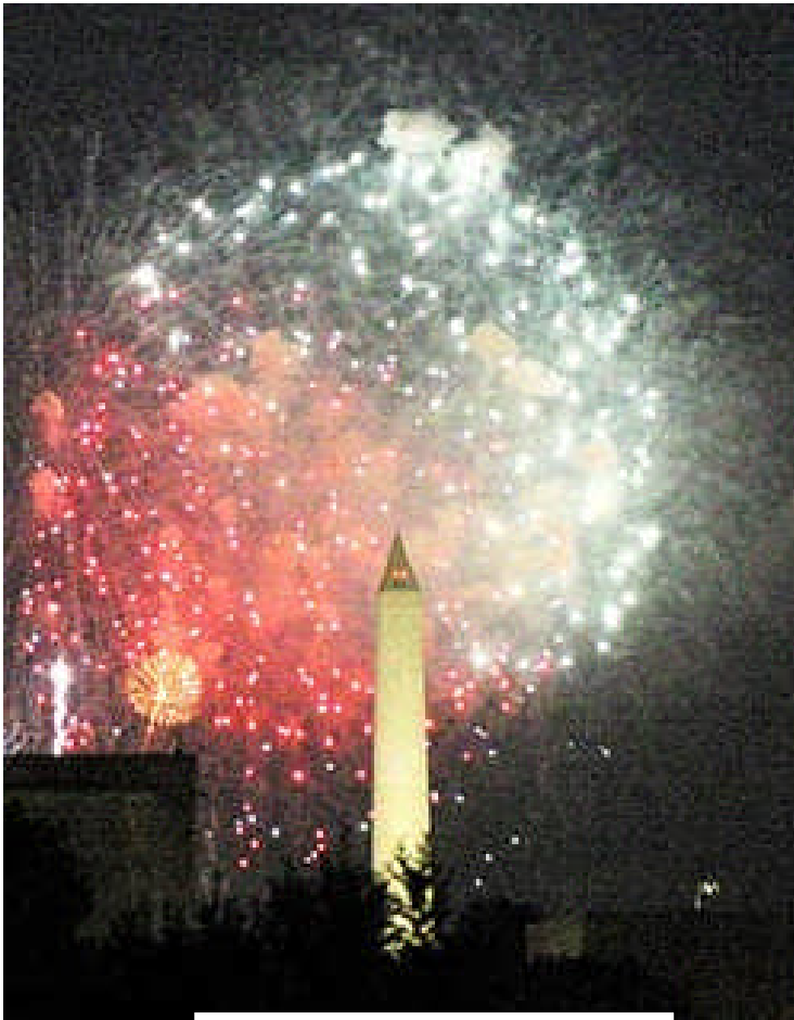
Figure 6. A spectacular view.

The fireworks displays, launched across the National Mall, are as spectacular as any I've seen.