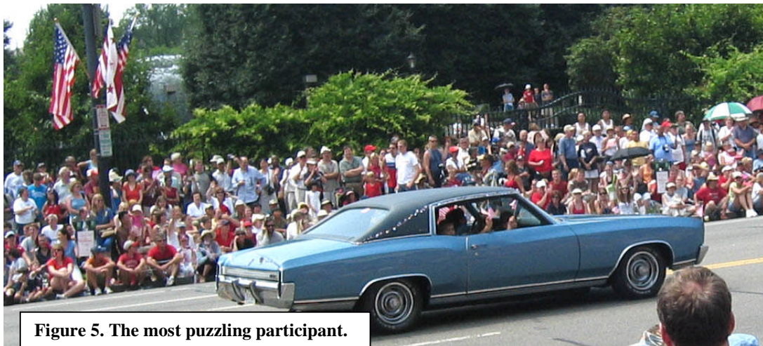
Figure 5. The most puzzling participant.