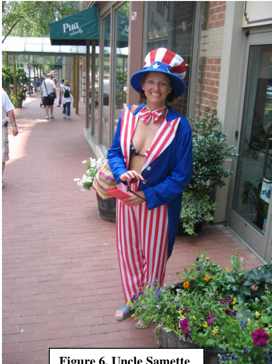
Figure 6. Uncle Samette

One more photo before I close this report. I snapped this picture of another Uncle Sam mannequin, although the term mannequin is not a fair description, because mannequin is defined as, "...a dummy for displaying clothes." She was certainly not a dummy and was gracious